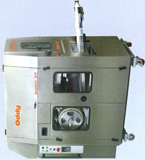
This Novatek is also available in 3 row configuration with a maximum output of 9000 pph